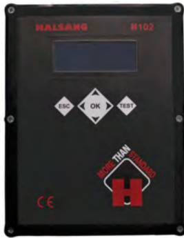
Electrical cabinet with a Halsang H102 controller and frequency modulators