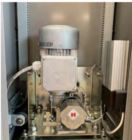
Motorisation Sleipner and heating element.